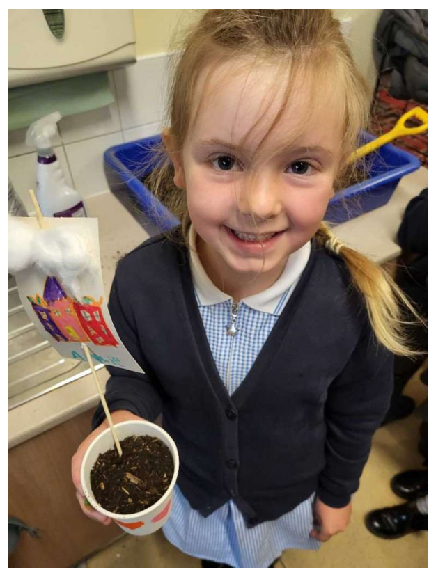
Everyone made a beanstalk and planted a bean. We had some lovely feedback and it was great having parents back in the classroom!

The reception classroom was a hive of activity when the parents were invited in to take part in a beautiful Busy Bees morning.