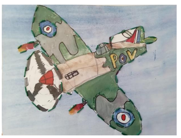
Year 6 spitfire artwork

They developed their sketching skills and created a watercolour palette based on military camouflage. To enhance the image further, the children used running stitch, highlighting the main features of the aircraft.